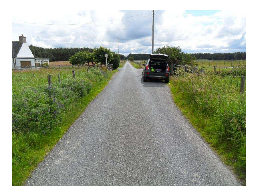
Passing Place 17