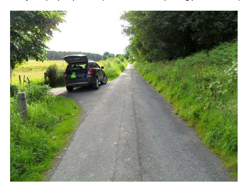
Passing Place 11

'Littlejohn' property access (located between passing place 10 & 11)