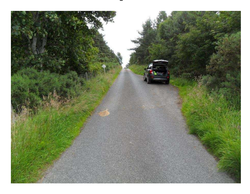
Passing Place 20