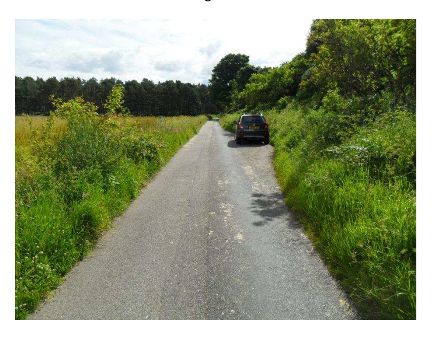
Passing Place 14 (proposed)