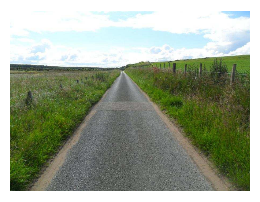
Passing Place 8