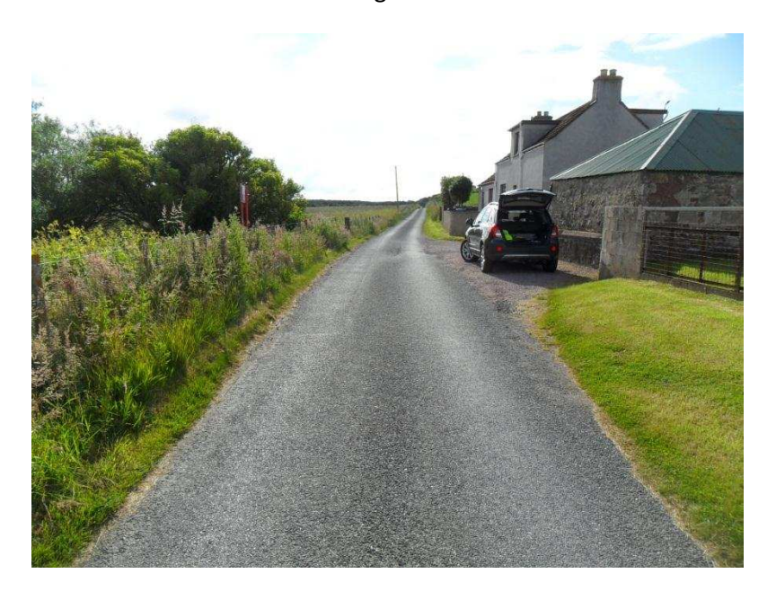
Passing Place 6 (proposed) - No photo for proposed location of passing place 7