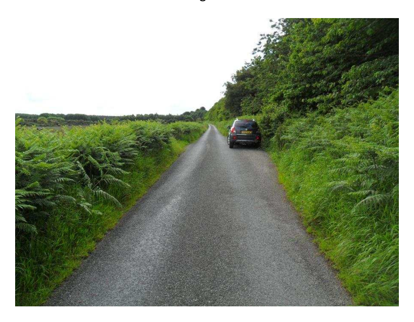
Passing Place 10