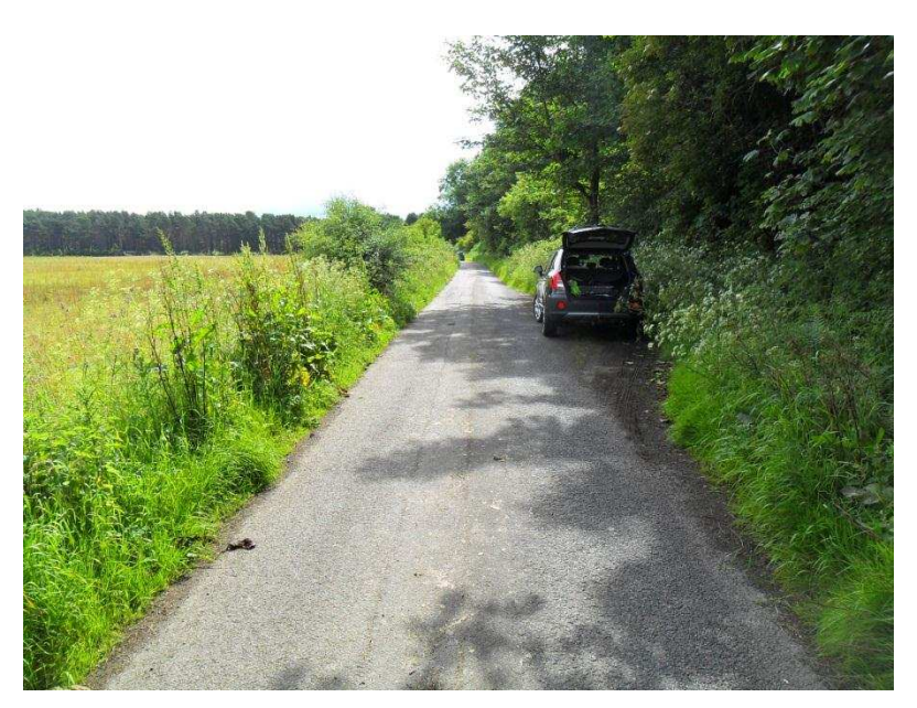
Passing Place 12 (proposed)