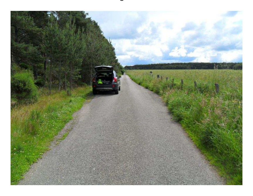
Passing Place 23