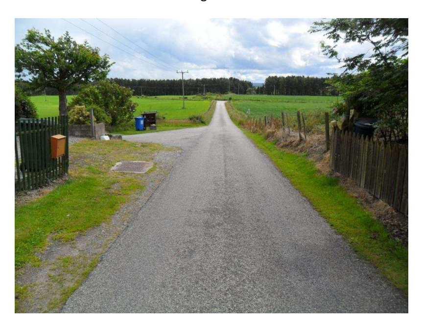
Junction onto B9092