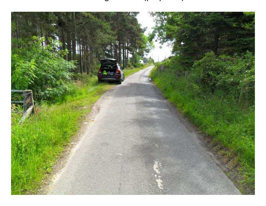
Passing Place 15