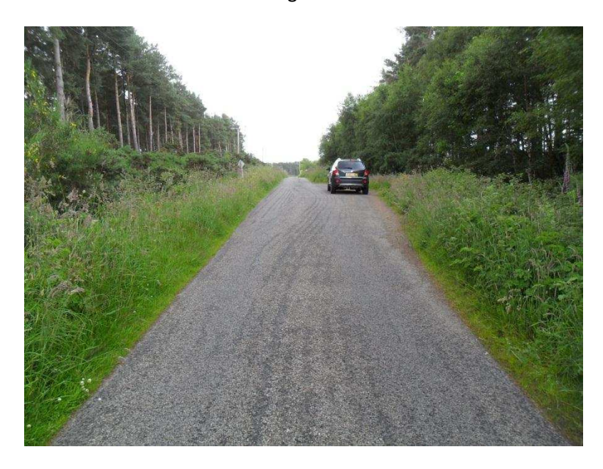
Passing Place 28