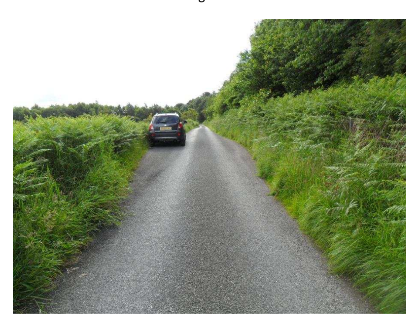
MOD access (located between passing place 10 & 11)