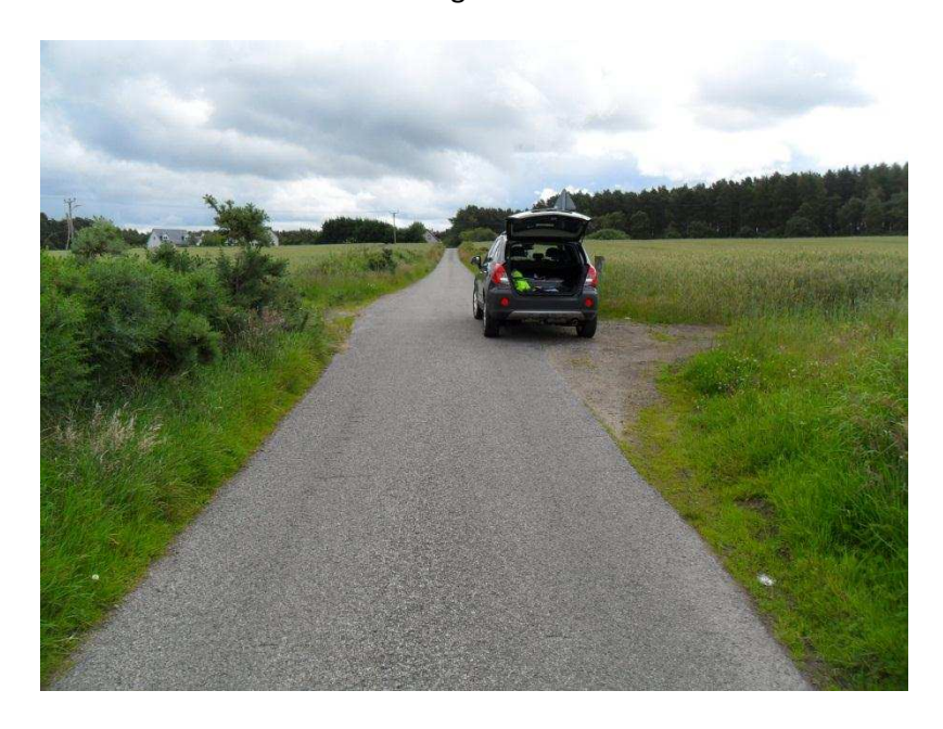
Passing Place 26