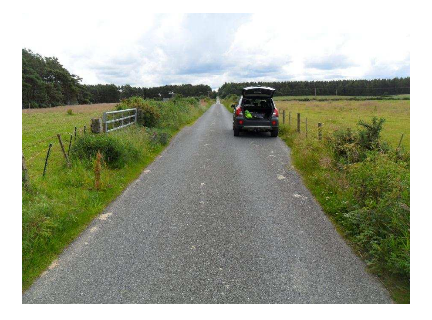
Passing Place 18