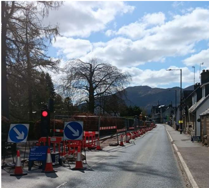
Image: Ongoing Main Street Works

Works are currently progressing in Main Street and Golf Course Road with the new sewer and associated manholes/chambers.